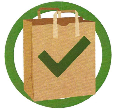
PAPER BAGS MADE FROM AT LEAST 40% POST-CONSUMER RECYCLED CONTENT